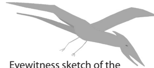
Eyewitness sketch of the South Carolina pterosaur